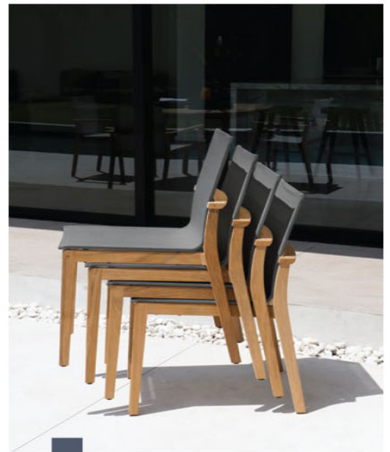
Seasons Teak Sling Stacking Side Chair

Designed by Danish designer Povl Eskildsen, our Seasons Teak Sling Stacking Chair features a sturdy stainless steel reinforced teak frame with sling-able fabric that allows for a comfortable sit without the use of cushions.