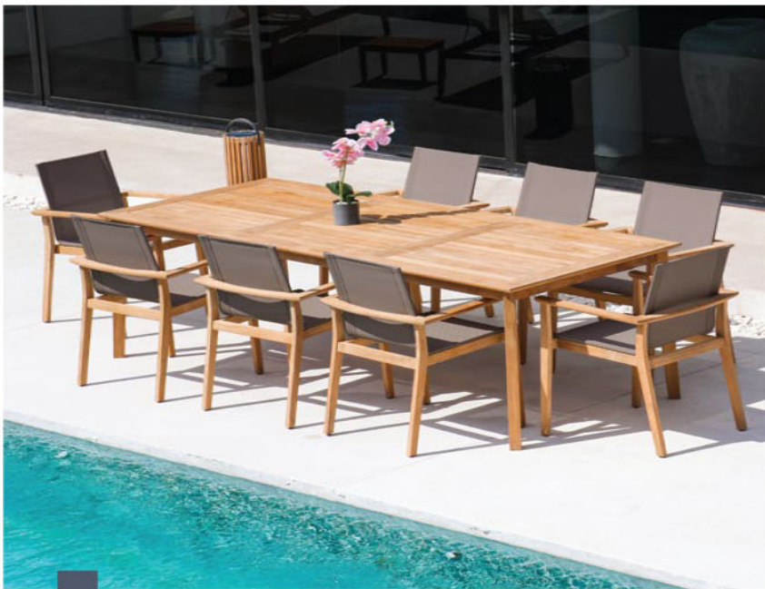
Seasons Teak Sling Stacking Arm Chair