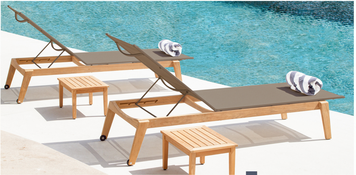
Seasons Teak Stacking Chaise Lounge

The clean and minimalistic lines of both of our stackable loungers or chaises is made possible through a clever combination of stainless steel+aluminium and stainless steel+teak respectively. This not only increases strength, but adds heft, which ensures the loungers or chaises are not easily effected by wind.