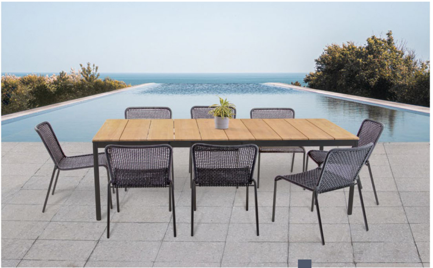
Seasons Teak 39" x 86" Rect. Teak Top

For customers seeking contemporary mixed material tables, Seasons Teak offers 8 seater tables with frames made from powder coated stainless steel that is fitted with table tops in teak or ceramic. Thanks to the use of stainless steel and T shape rails, the tables are both slender and stable.