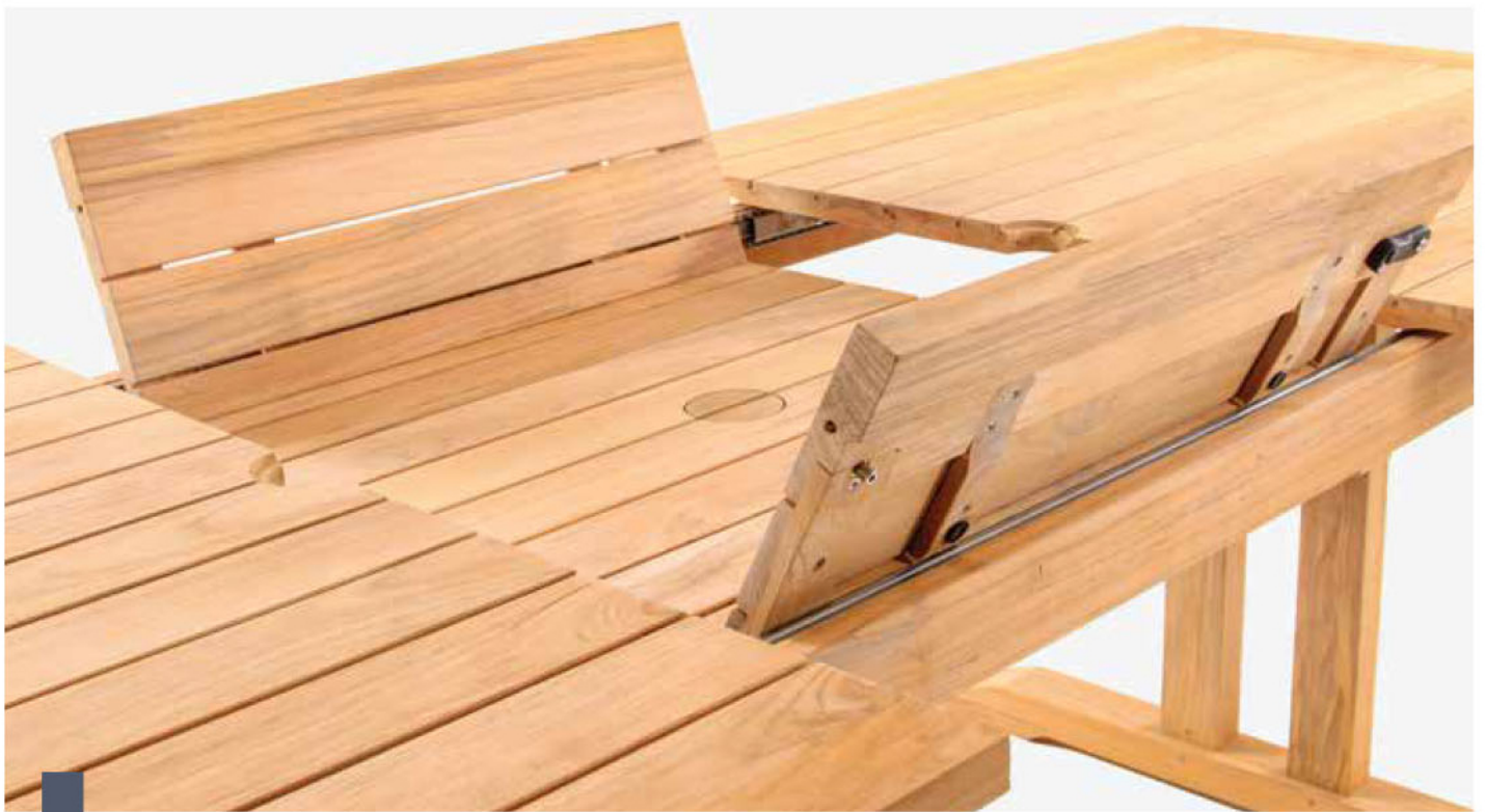
Seasons Teak Extending Table 83.5"/111" x 40"