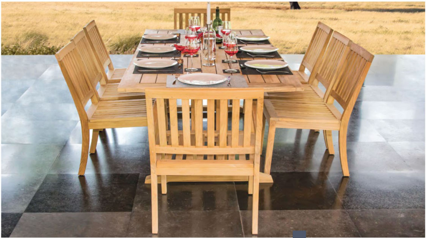
Seasons Teak Arm Chair and Side Chair

With a tip of the hat to classic teak outdoor furniture, our full teak collection takes the classic teak category to a new level of comfort and practicality. The essence of traditional heavy and uncomfortable teak chairs of old are morphed into a classic, yet light and comfortable design.